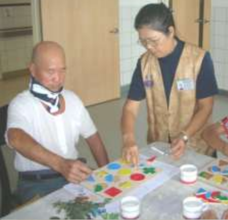
hand-made craft class