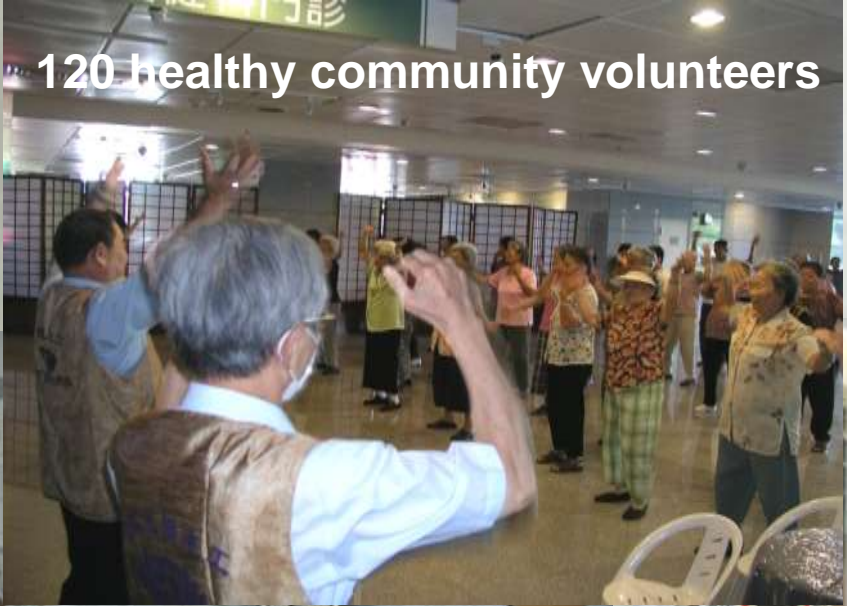
120 healthy community volunteers