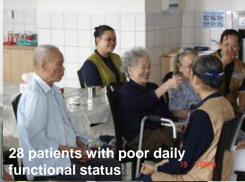
28 patients with poor daily functional status