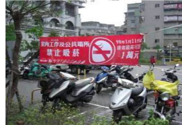
Smoking cloth hanging to strengthen smoke-free environment