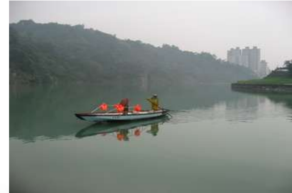
Dreamy riverbank by Bitan