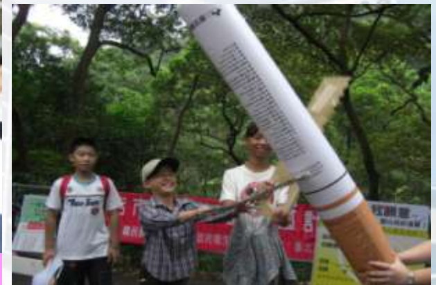
Hiking activities to join smoke-free community issues