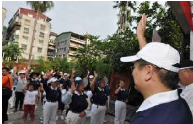
Community members took the anti-smoking propaganda with words