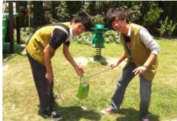
Youth volunteers are going to the park near the school to pick up cigarette butts