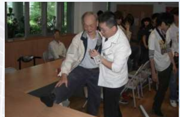
Physical therapists guide participants to transfer smoking attention by exercise