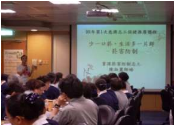
On volunteers to carry out training courses in order to better understand the harm of the cigarette