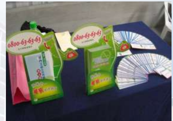
In the community center to provide quit information to local residents