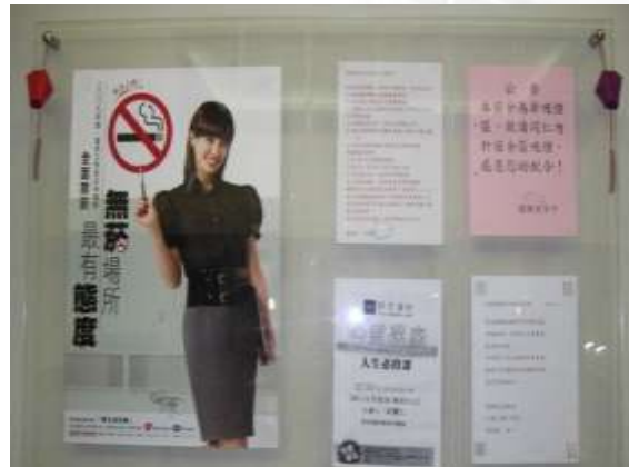
Staff Quarters notice smoke-free environment