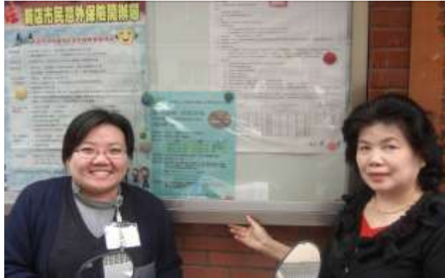
Invite village chief competent to assist in the community together to promote quit smoking