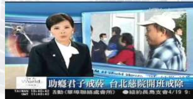
Media Play to quit somaking activities