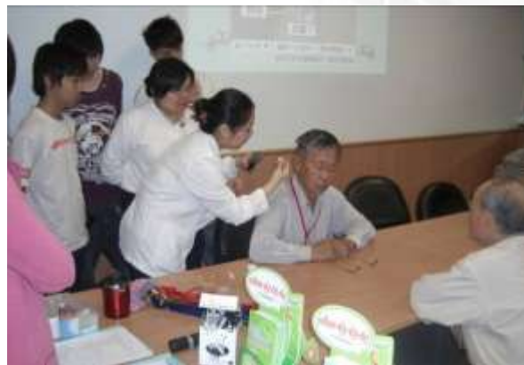
Chinese medicine massage the ear acupuncture points to reduce anxiety to quit