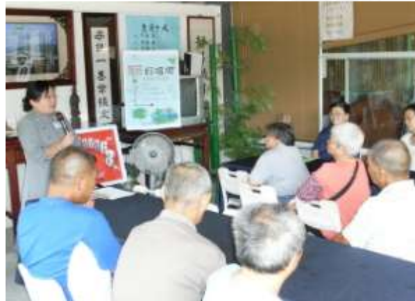
Commentary on the elderly community of the health risks of cigarettes and Tobacco Control Act