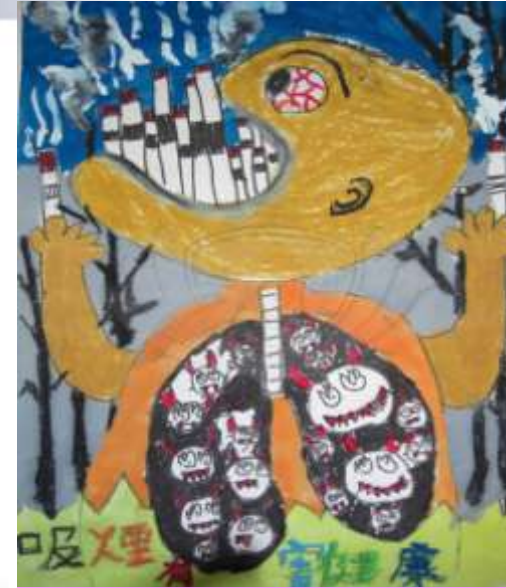
Children's drawing competition process - in the third grade works