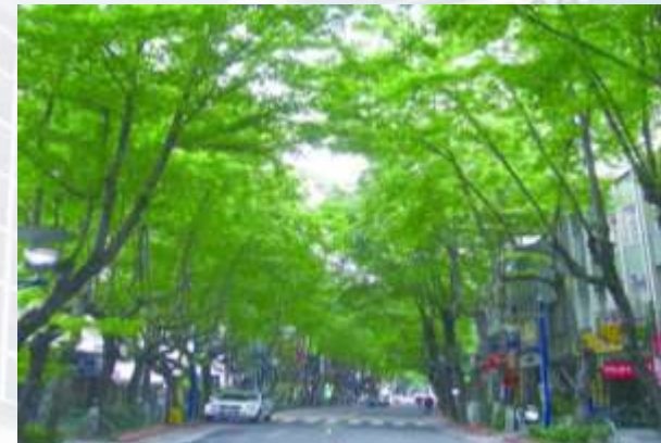
Zhonghua road's maple fragrance boulevard

Xindian is a city in Taipei County, located on the south border of Taipei Basin and one of the most important satellite cities. It is the seat of the Buddhist Tzu Chi General Hospital Taipei Branch.