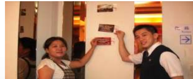
Convince the boss of the restaurant smoking sticker posted in the restaurant wall