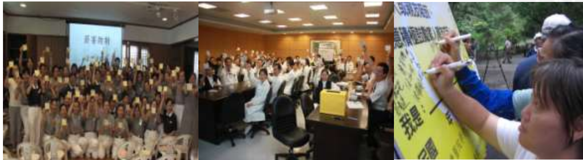
Volunteers. Health care workers and community members to sign cards supporting quit services