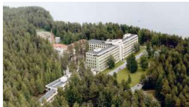
KINKOMAA HOSPITAL Beds 34