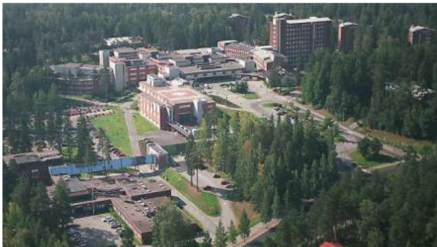
CENTRAL FINLAND CENTRAL HOSPITAL Beds 448