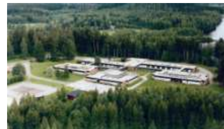
HAUKKALA HOSPITAL Beds 19