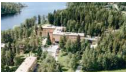
JUURIKKANIEMI HOSPITAL Beds 66