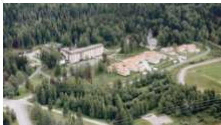
KANGASVUORI HOSPITAL Beds 77