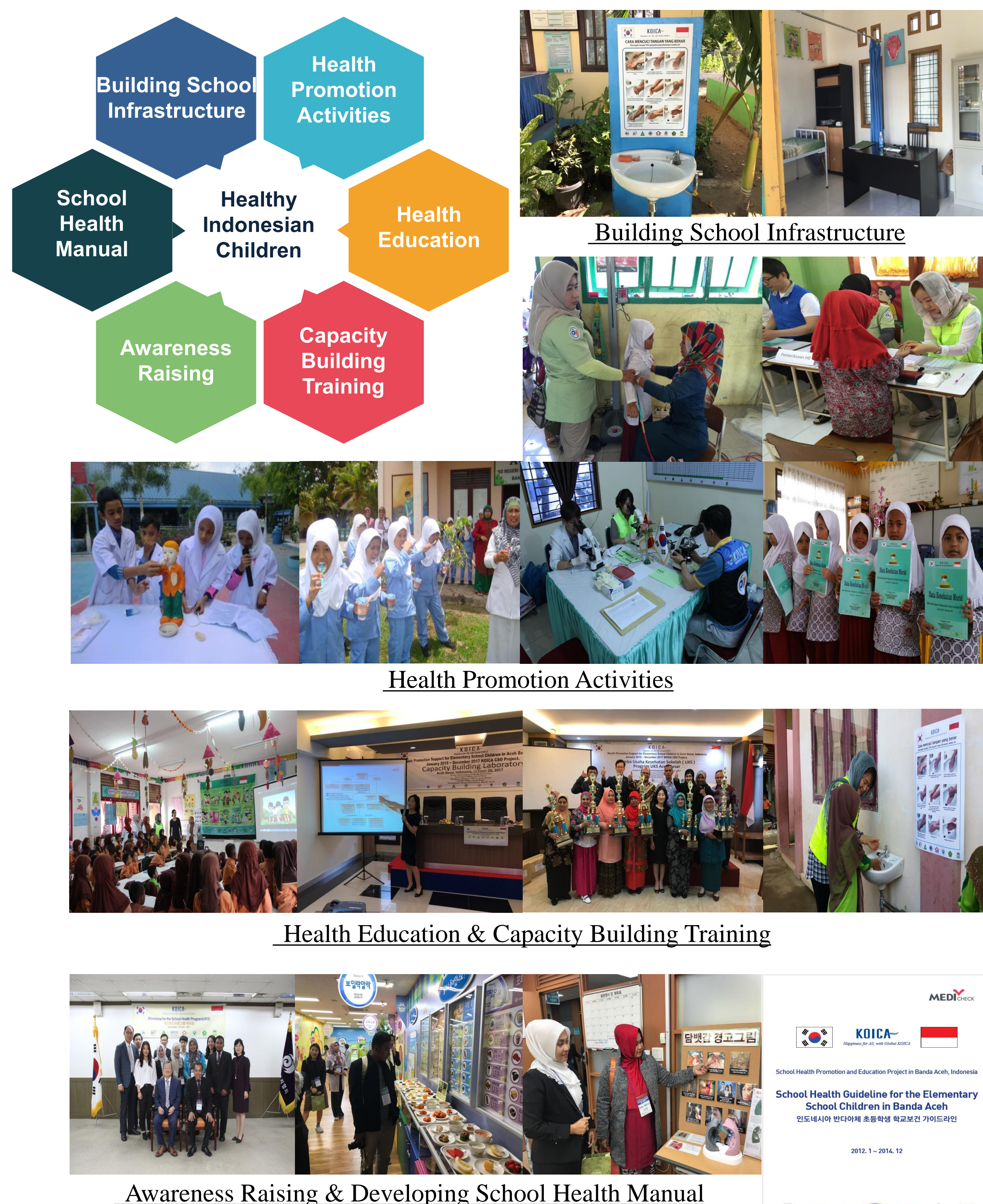
Figure 3. Specific School Health Practices for Indonesian Children