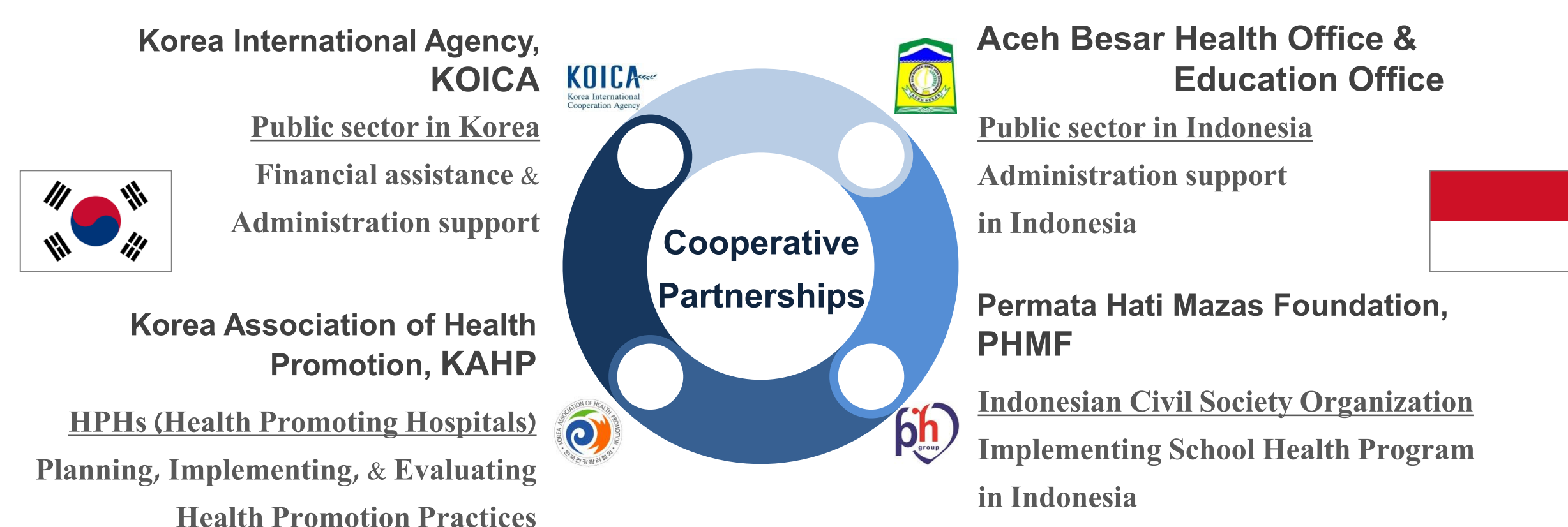
Figure 2. Cooperative Partnerships between HPHs in Korea and Indonesian Civil Society Organization