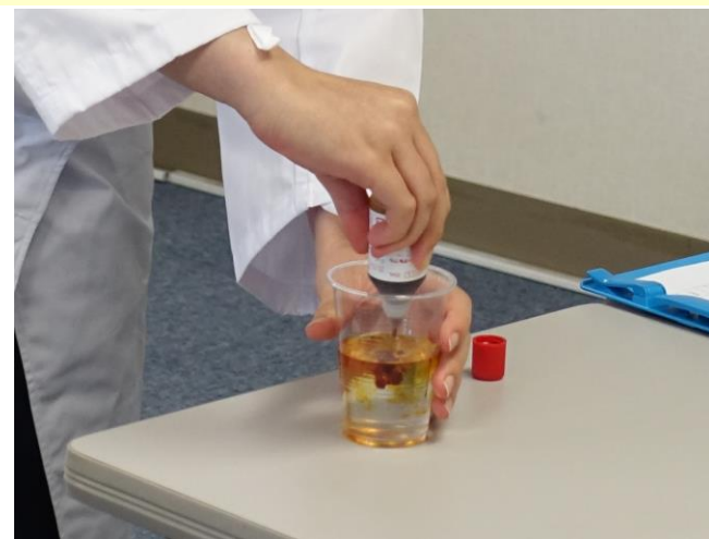
The experiment of gargle