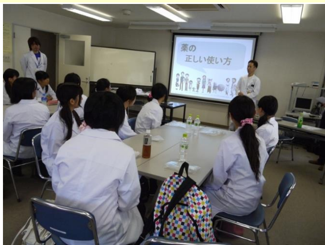
A class in session

(Methods) We give lectures on the proper of pharmaceutical products with experiments. Participants learn about dosage and administration, medical blood concentration. About drug abuse prevention, they learn the adverse effects that organic solvent and cannabis, stimulant, MDMA give to the health of the human body. Through our lectures, they understand fear of drug abuse. After that, they experience the work contents of pharmacist by using chocolate and soft drink instead of medicine.