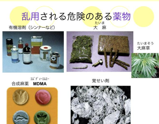
Drugs that is consider to cause addiction