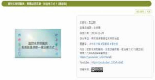
Pictrur3. Multimedia video