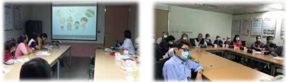
Pictrur2. SDM advocacy lectures