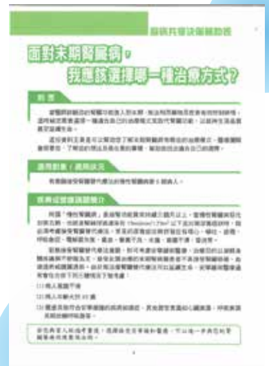
Pictrur4. Paper tool