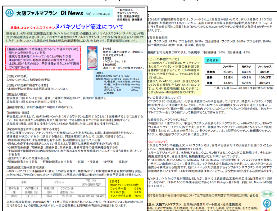
DI news for medical institutions and nursing homes