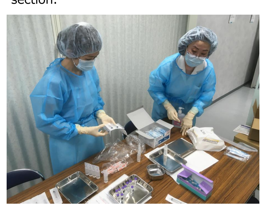
Covid-19 vaccine preparation work by a pharmacist.

During the pandemic, Aozora Pharmacy executed various health promoting activities to improve health literacy of users of pharmacy and community people. The specific features of Aozora Pharmacy's activity performed during the three years from March 2020 to March 2022 is stated in the Results section.