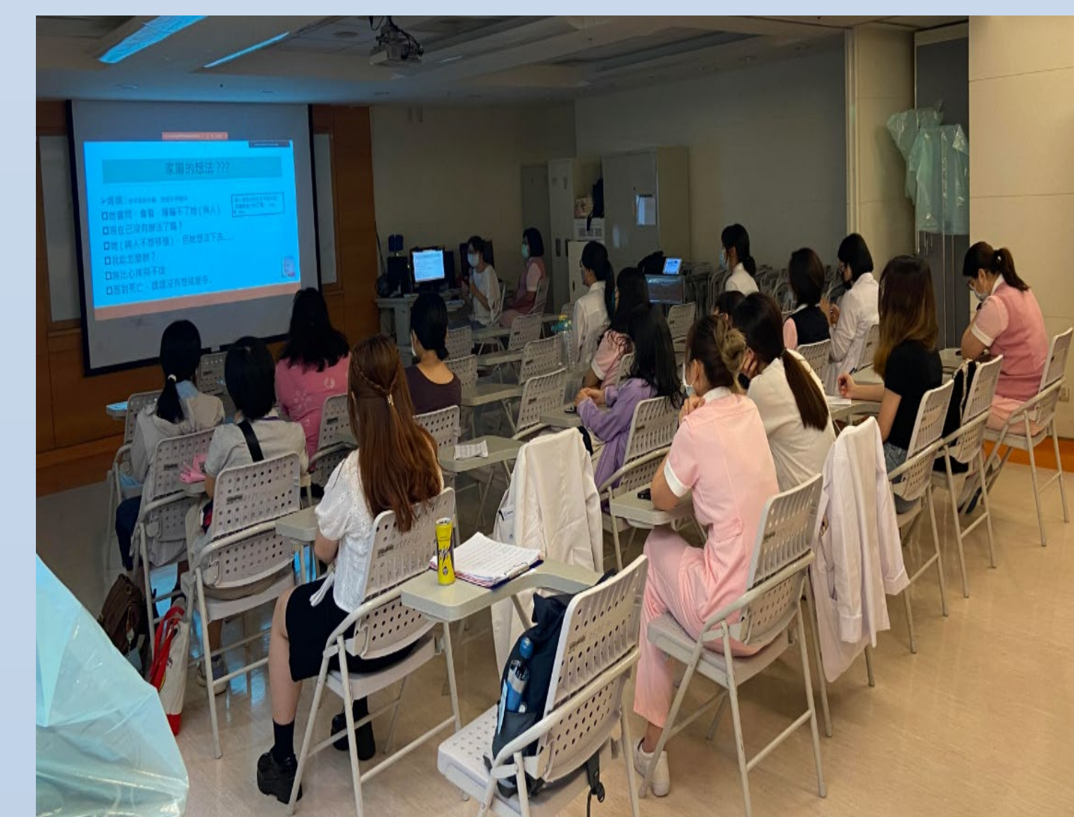
Figure 3. Clinical ethics consultation