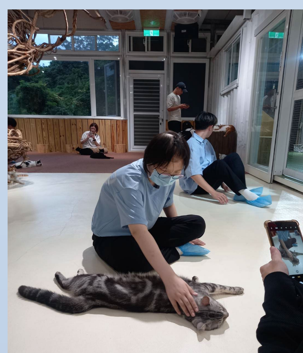
Figure 2. One of the patient's wishes visiting a cat cafe