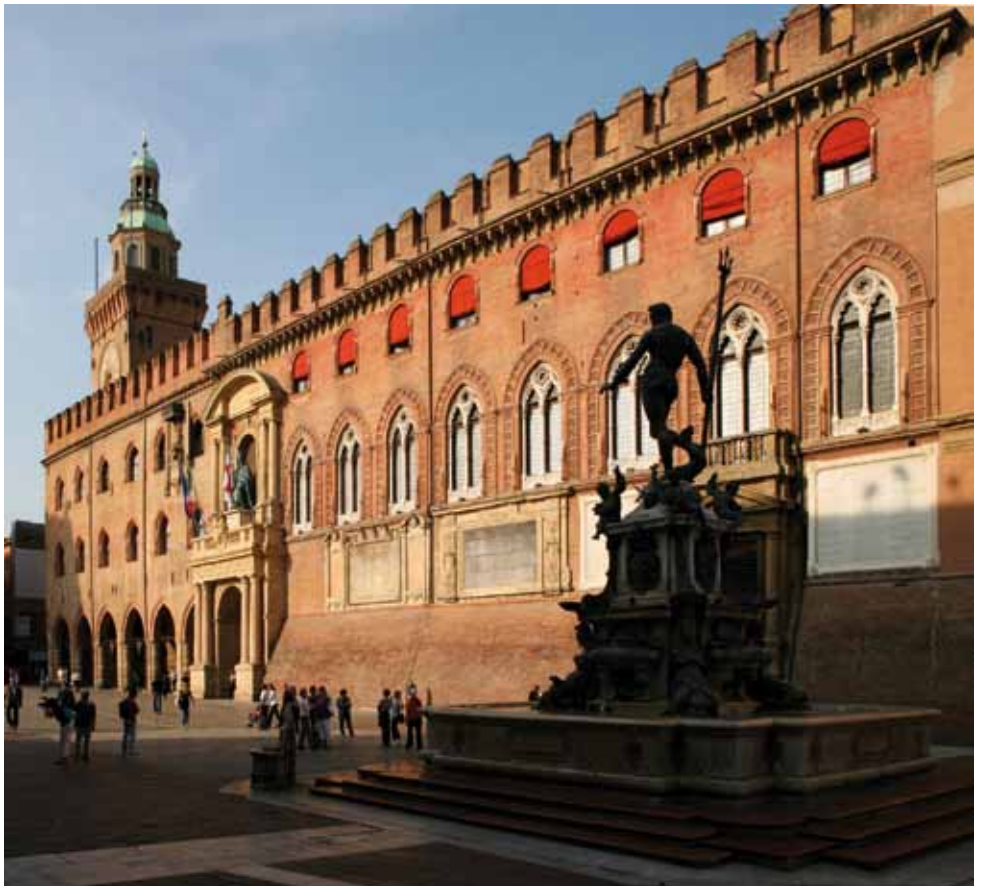
Fountain of Neptune and D'Accursio Palace