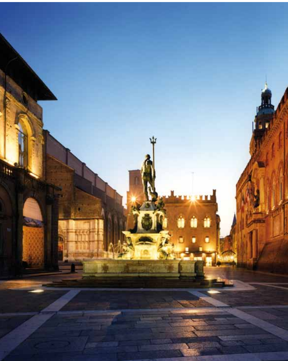
Fountain of Neptune