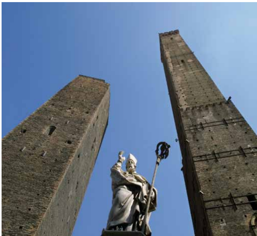
Saint Petronio statue between the Two Towers