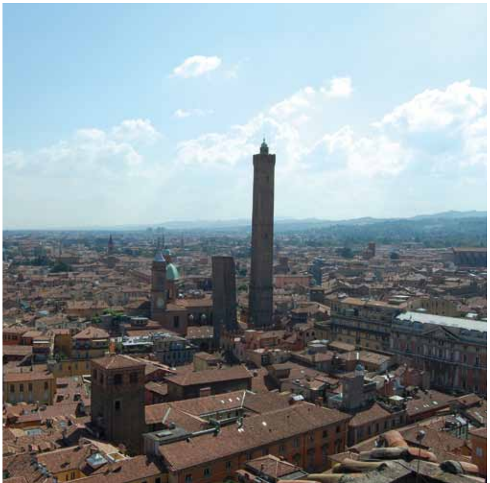
The Two Towers