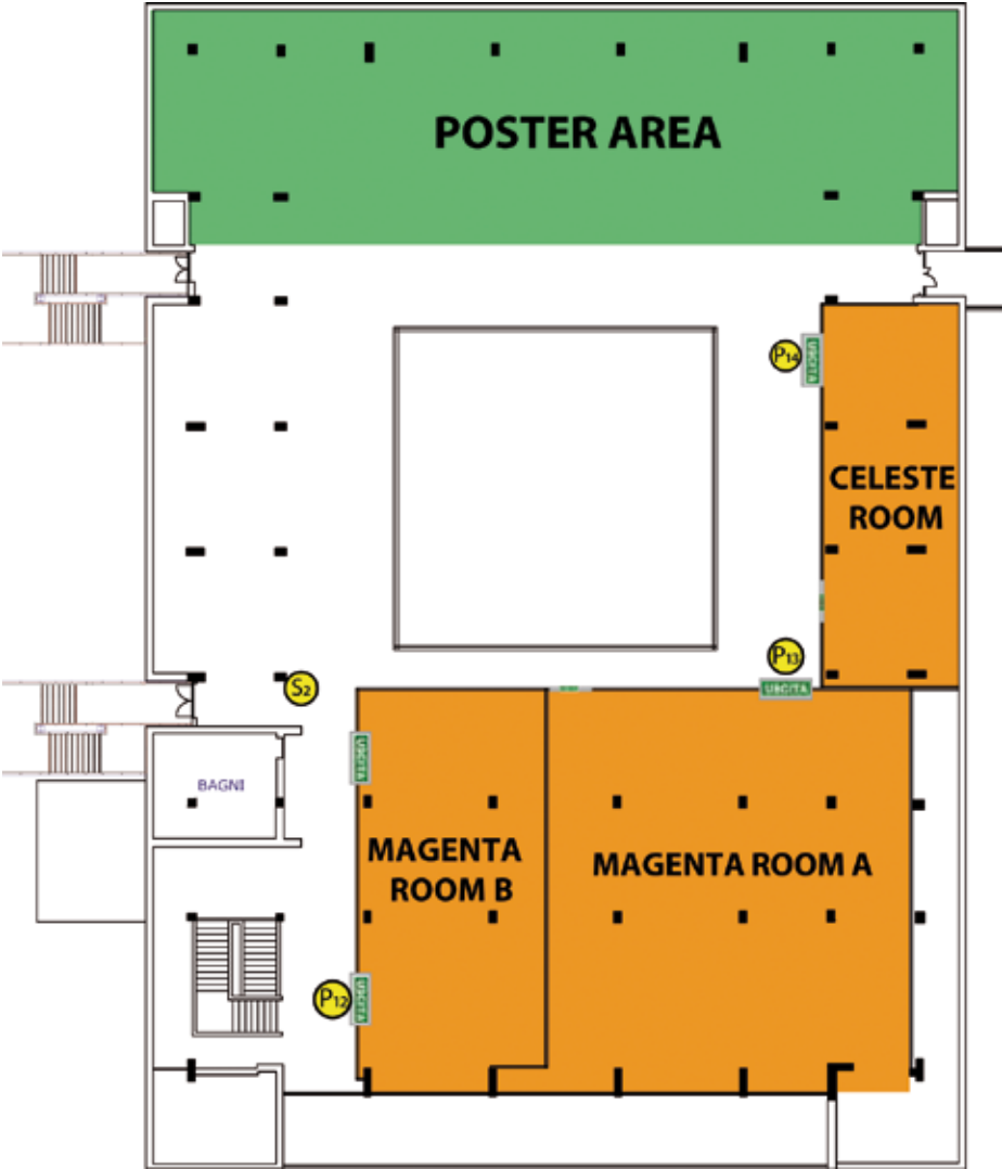
Sala Maggiore - Second floor