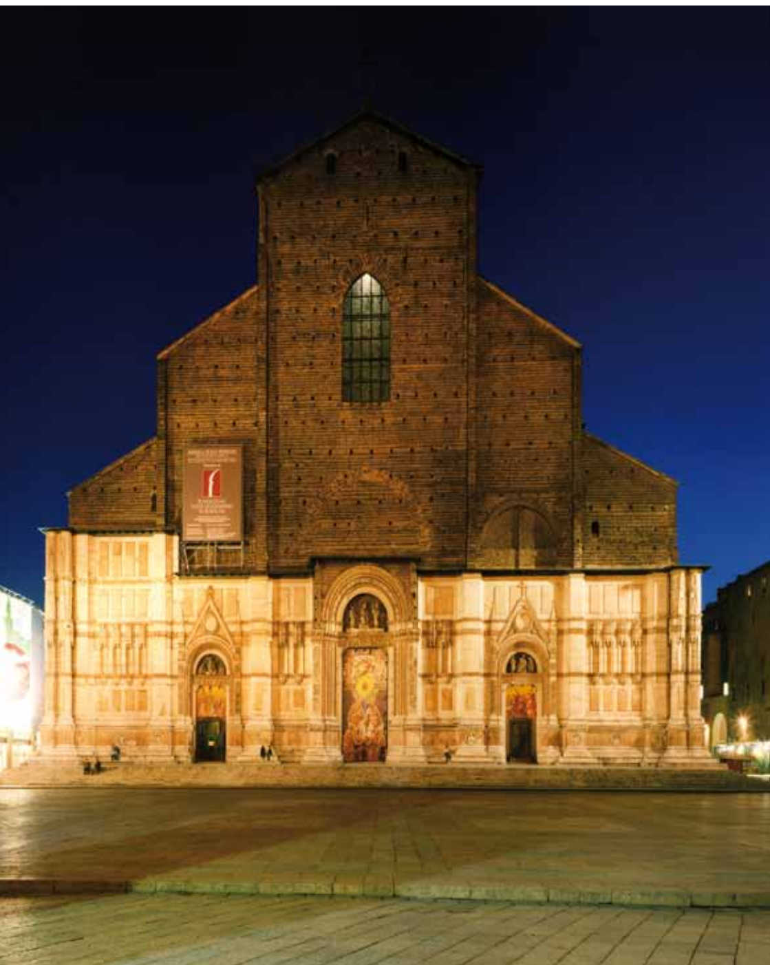
Saint Petronio basilica