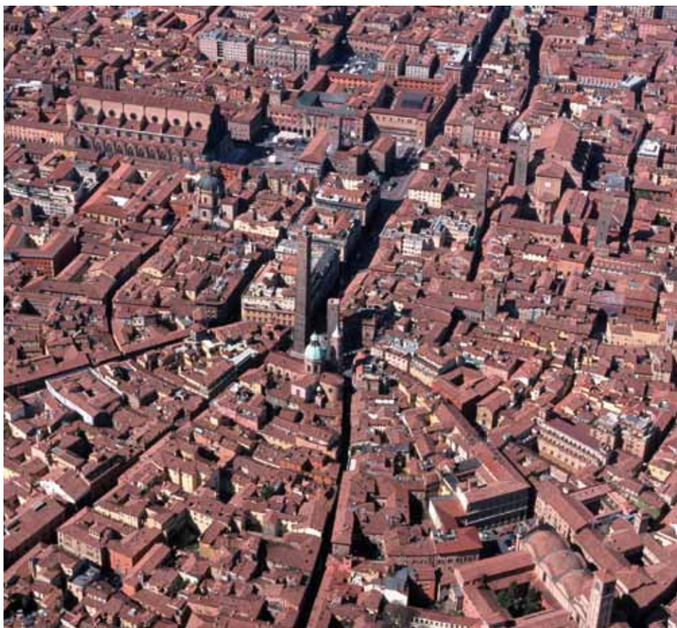
Bologna city centre